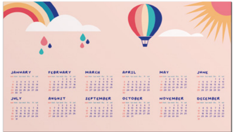
4CP4/035 .020 Rectangle Magnet Four colour process imprint 4" x 7"