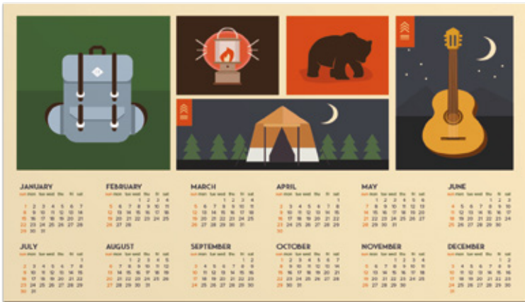
4CP4/020 .020 Rectangle Magnet Four colour process imprint 4" x 7"